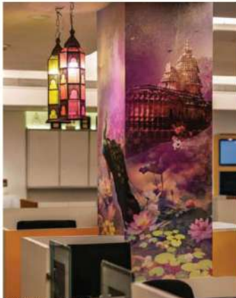
Aesthetically pleasing column