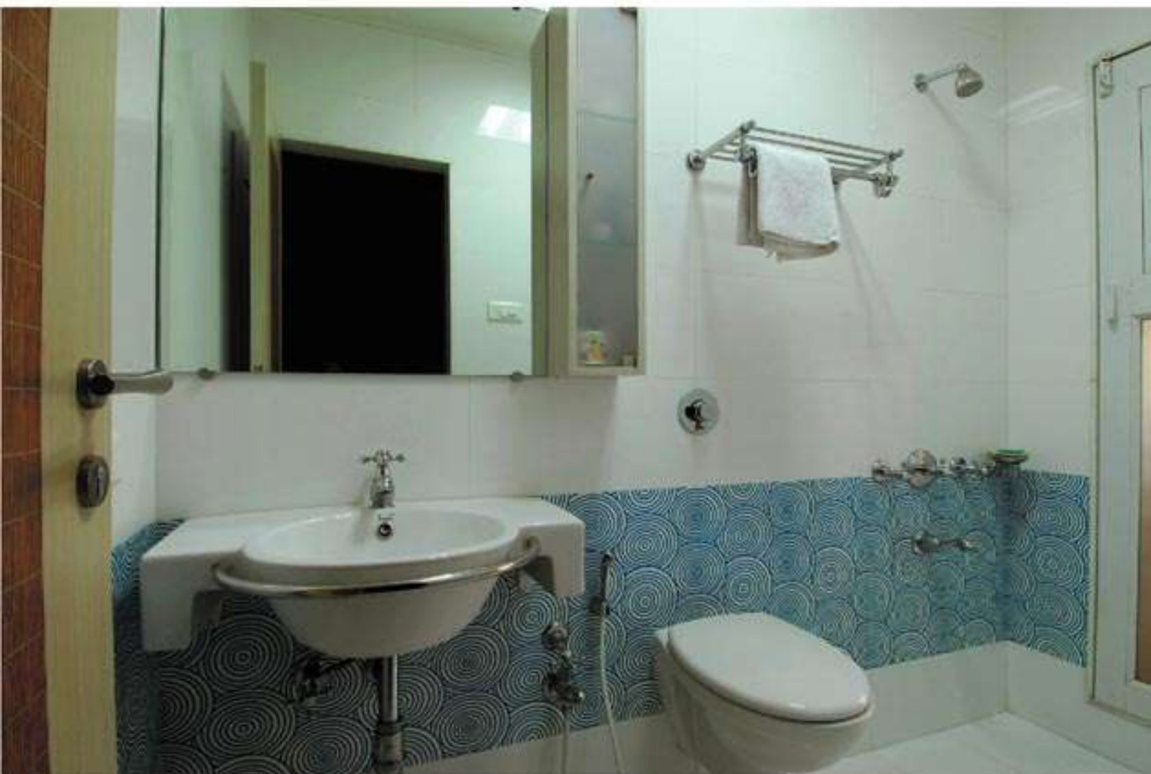
Swirls of blue - the band serves as a great added focus to this bath without much ado.

It can therefore be seen that the furniture is well within the functional needs of the design and in keeping with the overall ambience of the home.