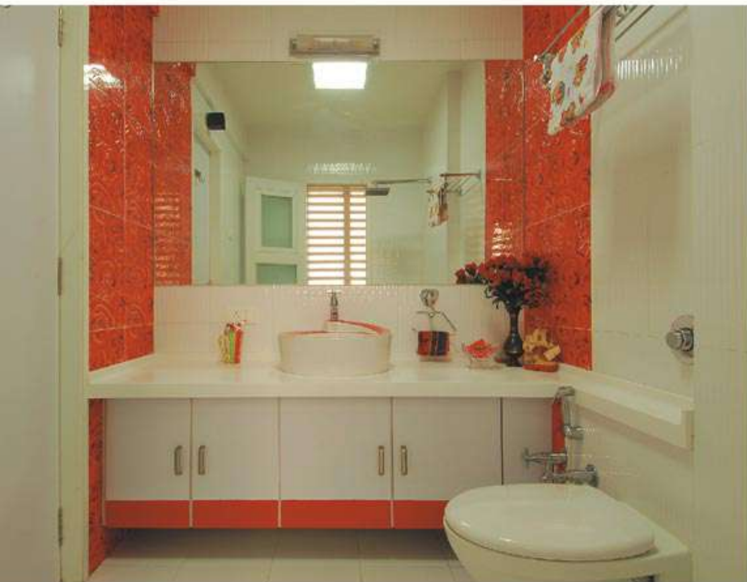
The rose red tiles and the swirled basin give this bathroom a romantic edge.