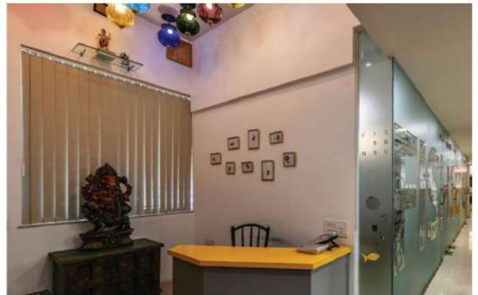
Reception with vintage lighting