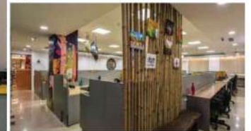
A Bamboo partition