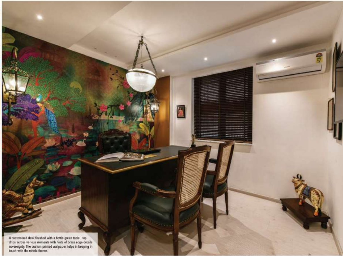
A customised desk finished with a bottle green table top drips across various elements with hints of brass edge details sovereignty. The custom printed wallpaper helps in keeping in touch with the ethnic theme.