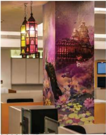
Aesthetically pleasing column