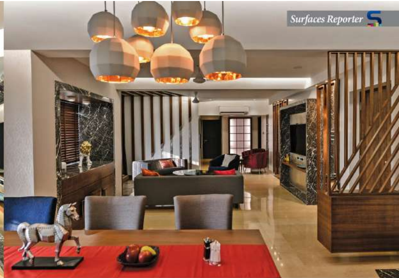
Asymmetrical elements in the dining are picked from the theme