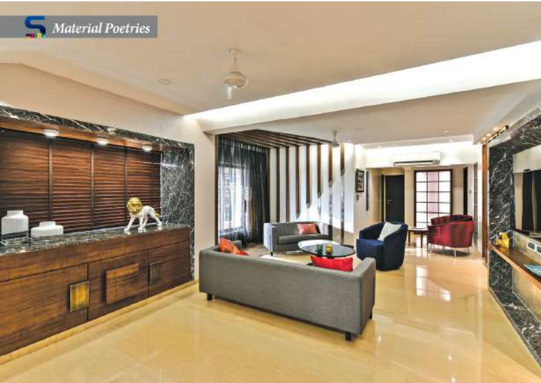
This wall is designed for visual pleasure in a combination of wood, marble and gold leafing