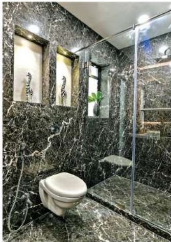
Common bathroom finished in champagne grey marble and onyx