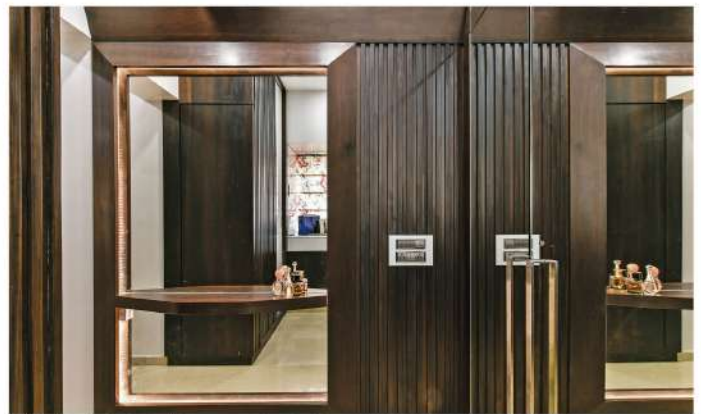
A full length mirror panel with indirect lighting was customised on site for the dresser.

“ As an architect you design for the present, with an awareness of the past for a future which is essentially unknown.”