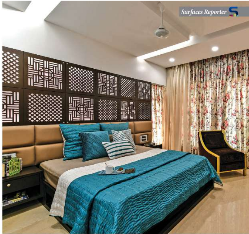
A backlit customised hand board comprises of laser cut panel with classical geometric motifs