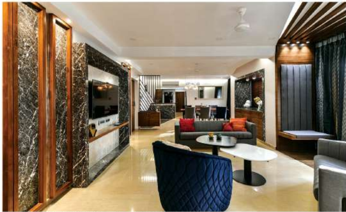
Overseeing the unique formal seating in the foreground and the dining area in the background